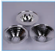
High efficiency reflectors