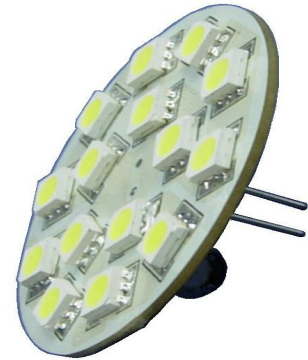
Back pin mounting Wafer

The high brightness Wafer uses only 3W compared to a 35W traditional halogen light source. The bi-pin fits into any G4 size fixture socket providing high performance, energy saving, and long lasting light output. Available in back pin and side pin mount.