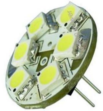
Back pin mounting Wafer

The high brightness Wafer uses only 1.5W compared to a 25W traditional halogen light source. The bi-pin fits into any G4 size fixture socket providing high performance, energy saving, and long lasting light output. Available in back pin and side pin mount.