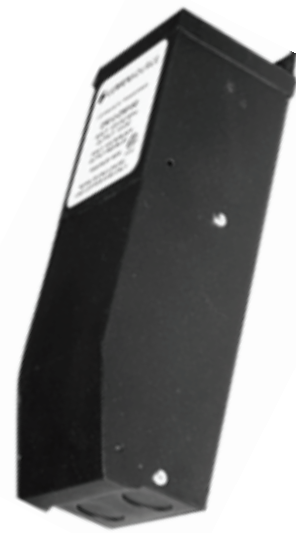
LED Dimmable Driver

The LED dimmable driver series is used for low voltage 12V DC LED indoor and outdoor installations. The LED driver can be dimmed using any regular 120V AC magnetic wall dimmer. The driver is perfect for powering led modules, neon LED, wall washers, flexible strips and digital strips.