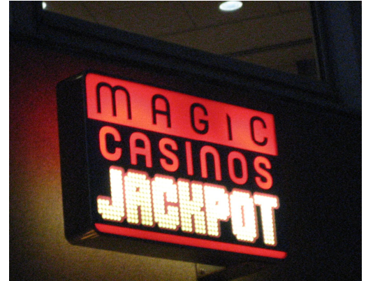
Back Lighting Applications

The high brightness Module LED can be used for back lighting channels on signages and exit signs or for replacing neon lighting. The modules can be easily screwed or adhered on to channel surfaces without the need for tedious labor work on installation. Modules are rigid and virtually maintenance free providing high performance, energy saving, and long lasting light output.