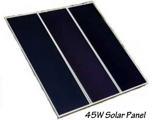
45W Solar Panel