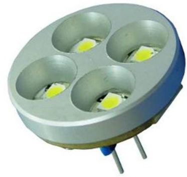
Back pin mounting Wafer

The high brightness Wafer uses only 1W compared to a 20W traditional halogen light source. The bi-pin fits into any G4 size fixture socket providing high performance, energy saving, and long lasting light output. Available in back pin and side pin mount.