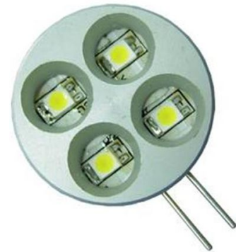
Side pin mounting Wafer